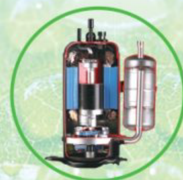
TFD30-220 Equipped with rotary compressors