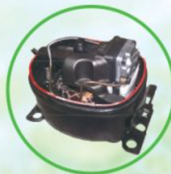
TFD6-22 Equipped with reciprocating compressors

TFD dryers are fitted with most high energy efficient, reliable refrigerant compressor from well-known international manufacturer.